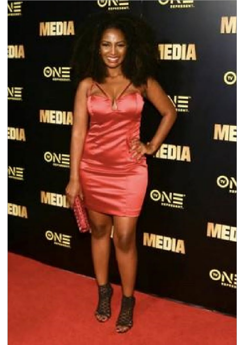
Premiere of Media in West Hollywood