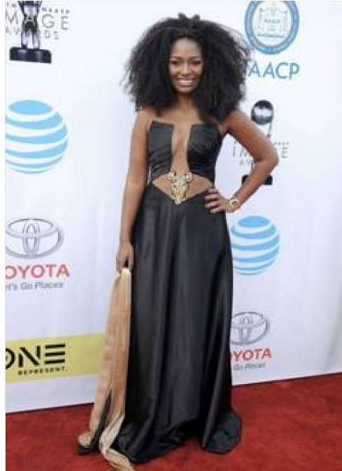
48th Annual NAACP Image Awards